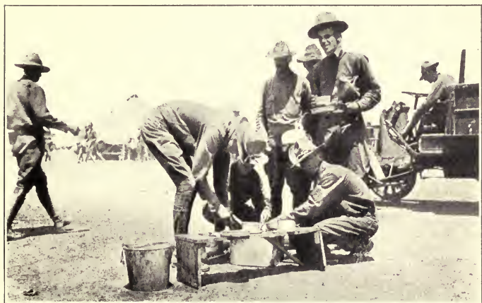
WASHING UP AFTER MESS